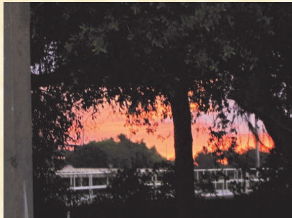
Sunset Over the Marsh at Epworth Pier

On June 25, 2011, Bella Italia held its first summer picnic at Epworth-by-the-Sea, Gascogne Bluff, under the pavilion. It was a wonderful time, and in our typical Bella Italia style, we added gusto and flair that only Italians can! There are so many thanks to go around; to picnic organizers, volunteers and attendees, and not enough room here to cover them all. First and foremost though, our huge gratitude to Laura Biondi, our Social and Cultural Activities Chair for the amazing way she pulled all the particulars together on a rather short notice, and turned it all into a well-tuned and fun event with the entire Board offering services and gifts. We also owe gratitude to Janice Passaro for