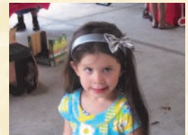
Party Crasher 2