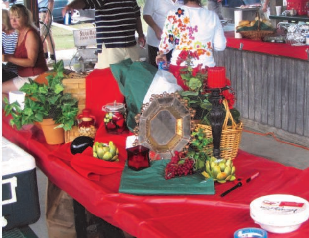
Our Main Table Courtesy of Janice Passaro

All the photos seen here can also be viewed at: http://bellaitaliapicnic.shutterfly.com/ and/or ordered in a professionally printed 8 x 8 soft cover booklet for the price of $40.00 for 36 photos and 20 pages. Please e-mail Bella Italia at bellaitaliagoldenises@yahoo.com if interested in buying a photo-book.