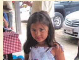
Party Crasher 1